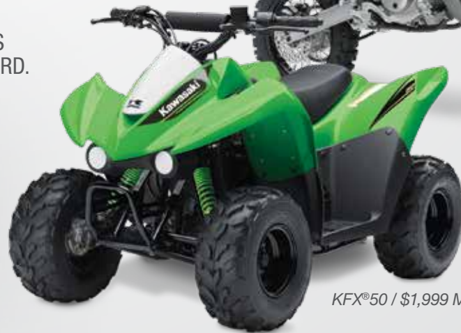
KFX®50 / $1,999 MSRP