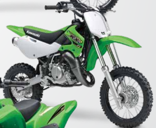
KX™65 / $3,699 MSRP